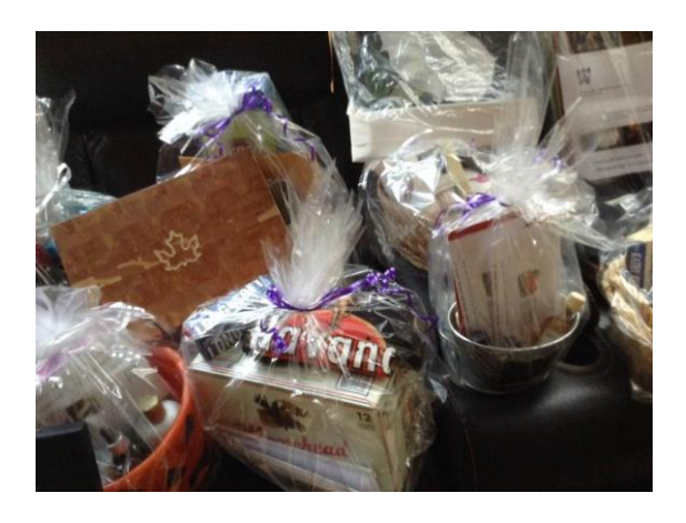
"To enhance people's enjoyment of Buck Lake now and for future generations"