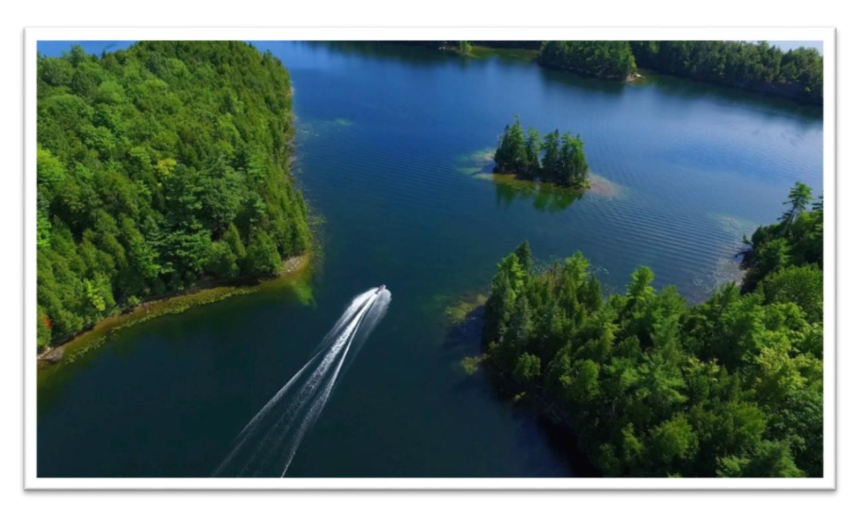
North Tip of Pulpit Island

The following amazing drone photos were recently posted by Sue Berezney.