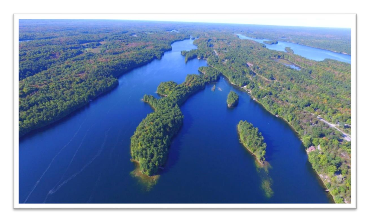
Birch Island Looking South

Click <u>here</u> for more great posts like this (Note: you must have a Facebook account to access this site.)