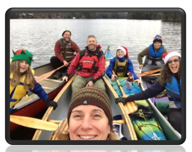
A Christmas Day paddle with family and friends