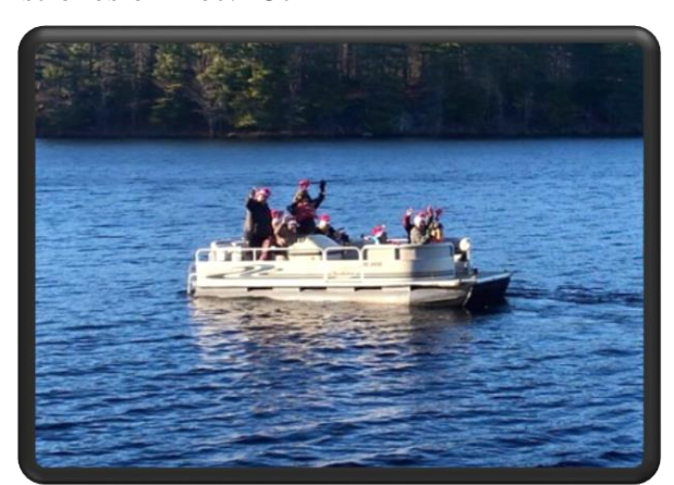
Victoria Creighton and family enjoy a boat ride on Christmas Day