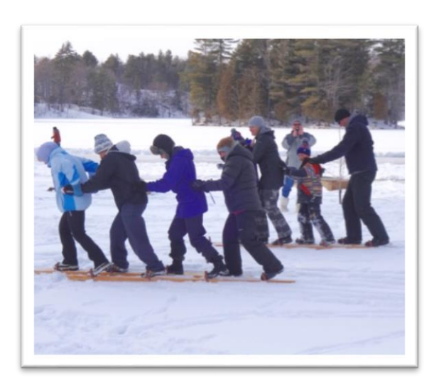
One of many exciting races