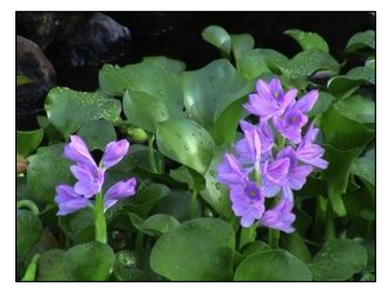
Water Hyacinth (Invasive)

On July 7<sup>th</sup>, Terry Demers and I conducted a survey of the North Branch of Buck Lake looking for invasive aquatic plants. We were specifically looking for any of 8 aquatic plants that have been found in or near other Ontario lakes. (More details about these plants can be found in the May 2015 newsletter.) Whenever we saw anything that we thought might be an invasive plant, we took pictures and noted the GPS coordinates. All the data was then submitted into EDDMapS (Early Detection and Distribution Mapping System). We found several plants that looked to us like it might possibly be water hyacinth. Before any information was stored in the system, experts reviewed the images to verify that we had made a correct assessment. As it turns out, the plants were all pickerel weed. This was very good news, as it is growing in many locations on both branches.