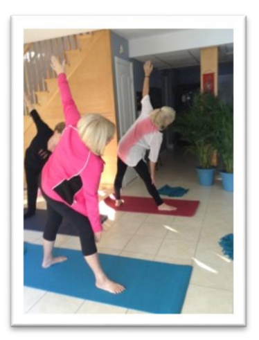
Friday morning class