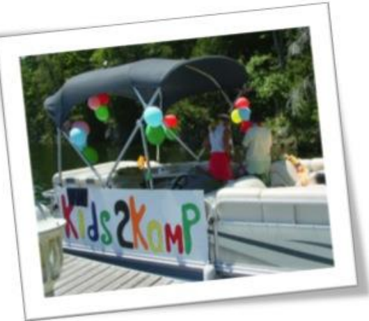
No entry fee Just donate whatever you can

All donations are presented to an Easter Seals representative when the boatilla ends