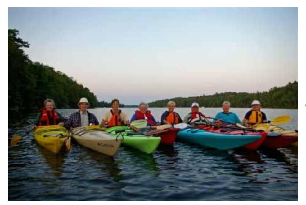
Wednesday evening Kayakers