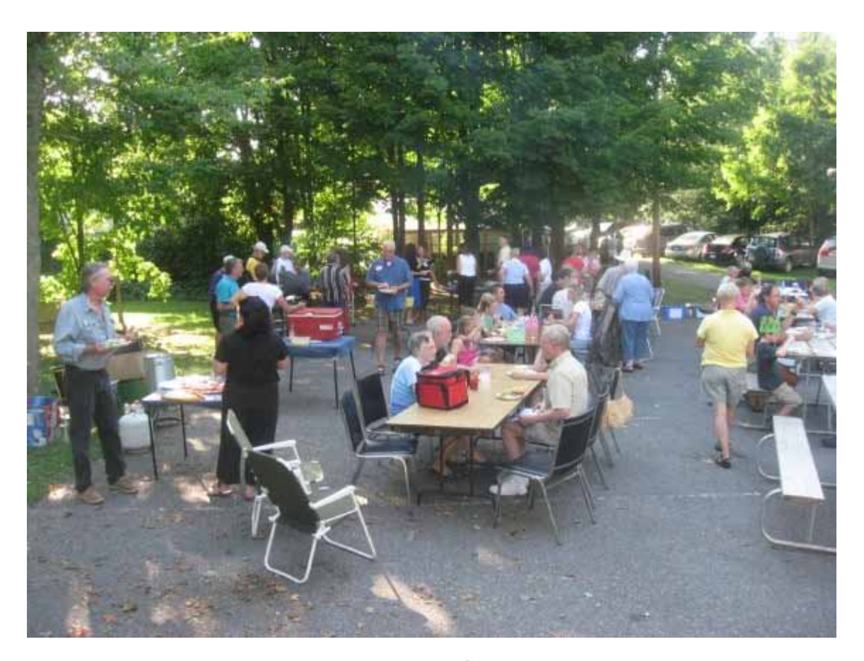
Annual BLA BBQ