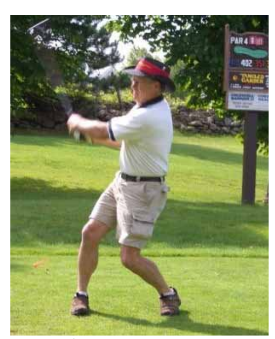
One of ~40 Monday Golfers